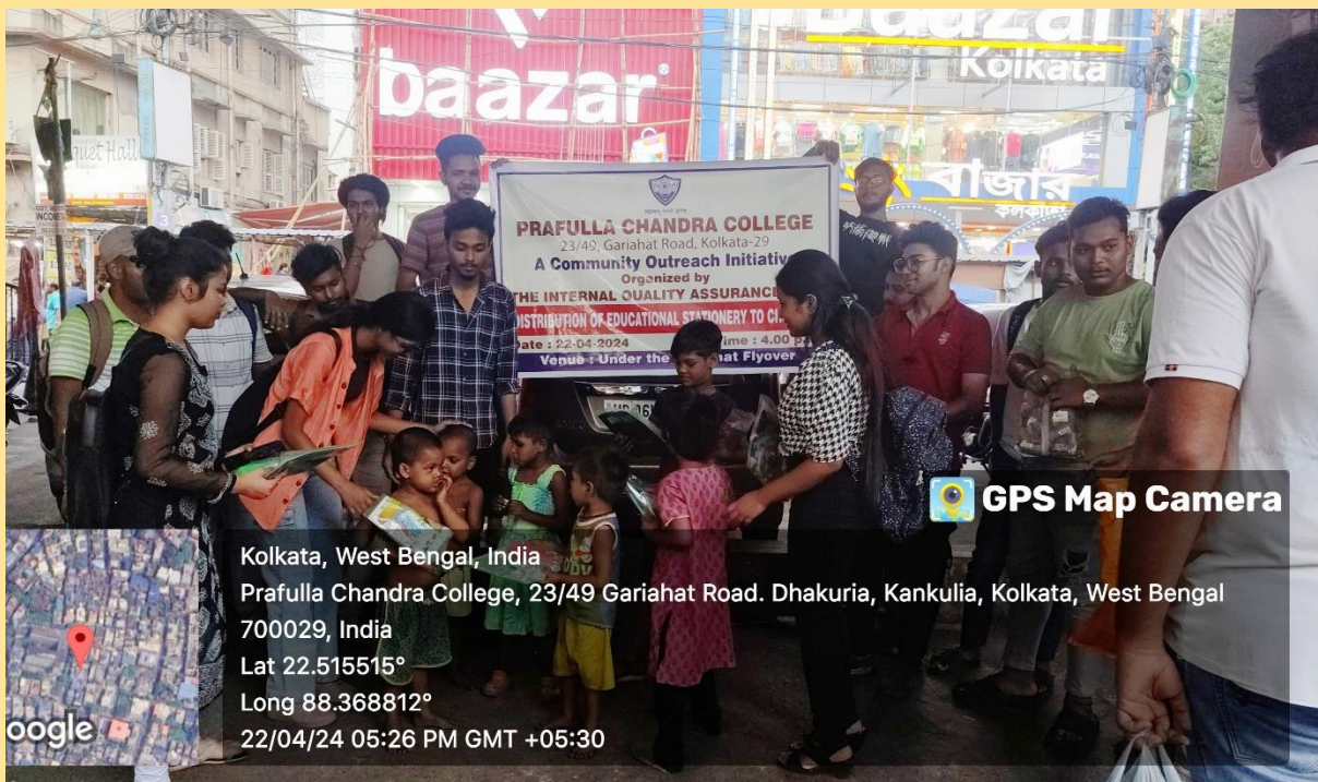
Distribution of Educational Stationery to Children of Underprivileged Families