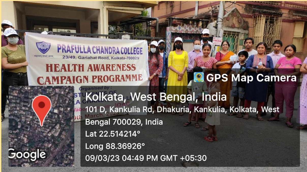
Health awareness Campaign in Local Community