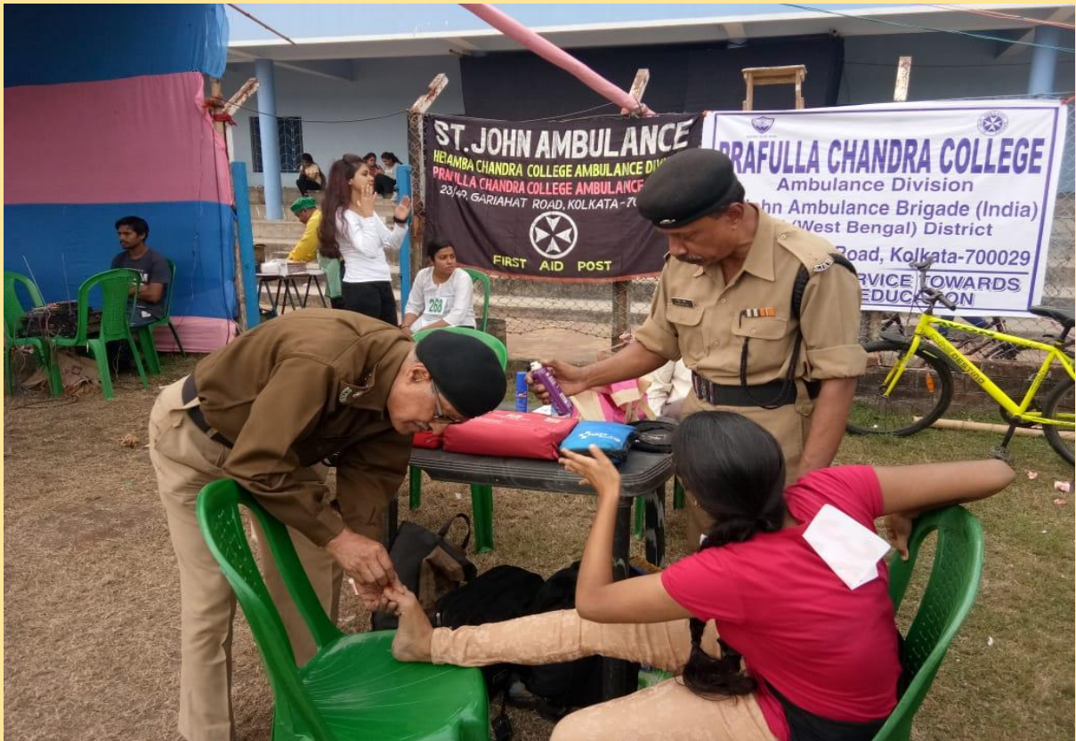
Beyond the College: Providing First Aid at Community Sports Event