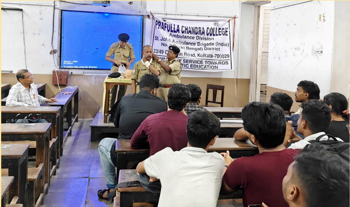
First Aid Hands-on Training to College Students